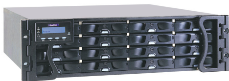
16-bay EonStor RAID Subsystem

devices. After considering price/performance and the recommendations of the system integrators, the computer center decided to adopt EonStor RAID subsystems from Infortrend Technology, Inc. for online and drive backup. They purchased two high-density, 16-bay RAID subsystems—a Fibre Channel to Fibre Channel (FC to FC) EonStor F16F-S and a SCSI to SATA EonStor A16U-G.